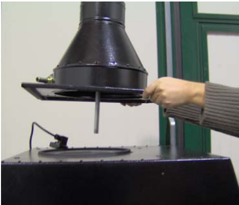
Take out the screws- place filter cover