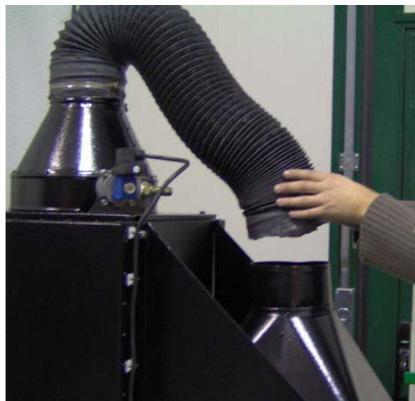
Place the accordion pass tube both side and fix them using pipe-clip