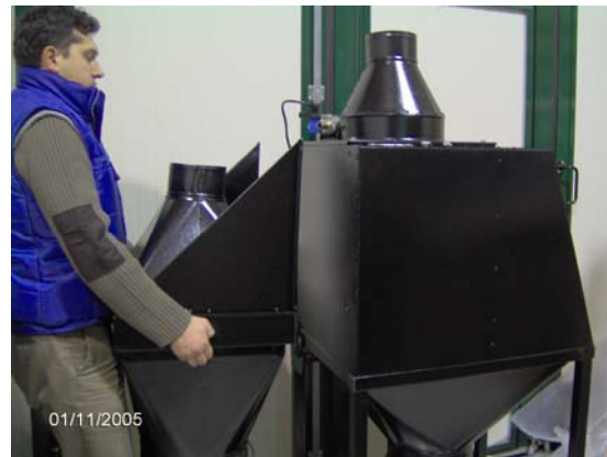
Take out the screws from rear of the machine and place the back unit using the screws